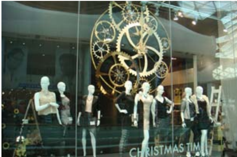
16 Above: New Look 2013 Visuals and final scheme in store

Whether you would like us to help you develop an idea or concept of your own, or if you would like to create a complete scheme from start to finish, we can help.