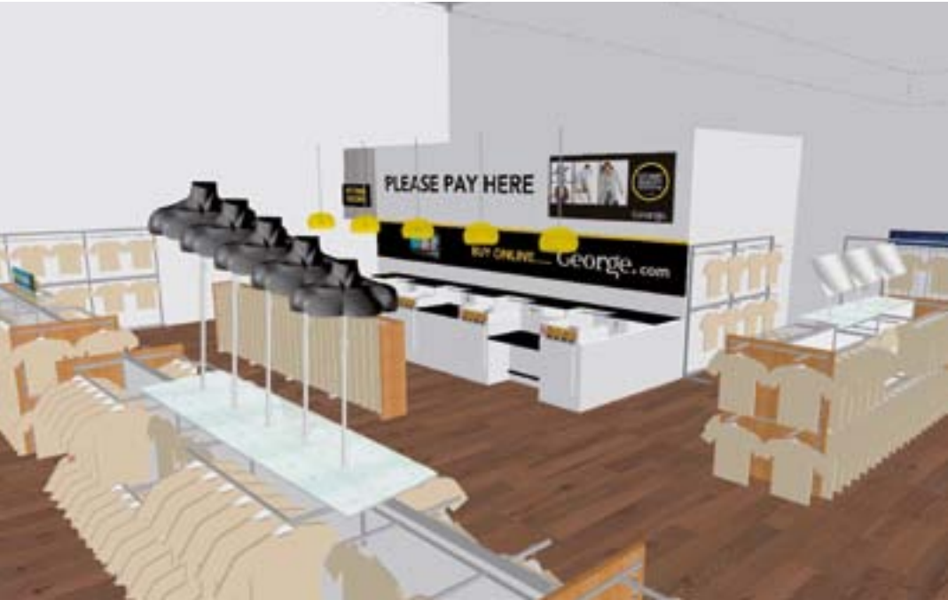
Above and overleaf: George at Asda 3D visuals and final scheme in store

We will develop, by way of a collaborative creative process, tailor-made and precise visual design concepts for you, to meet your exact requirements. From 2D and 3D visuals of the concept in its early stages, right through to visuals, pre-production prototypes and sign off samples, our experienced team translates our clients' ideas into reality.